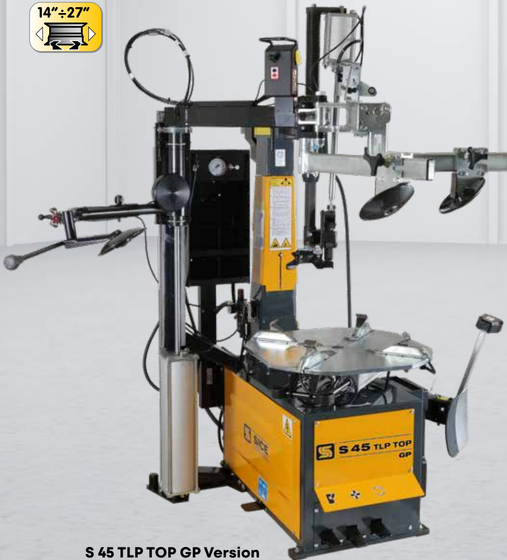
S 45 TLP TOP GP Version

Fully equipped 'LevalaLeva' automatic tyre changer